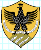
Università degli Studi de L'Aquila